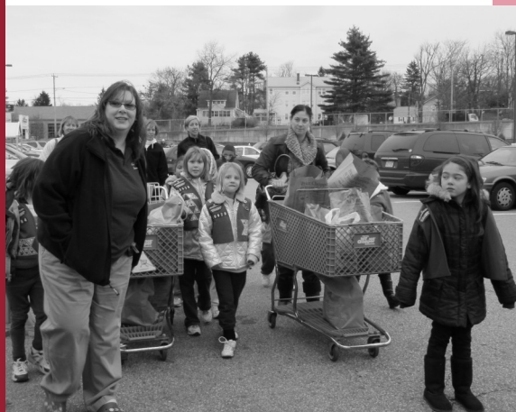
West Boylston Brownie Troop #30978 at the WSRS Feed Worcester County Food Drive

AAA of Southern New England Coca Cola Gospel Road Group Hannaford Supermarkets HMEA Grand II NetApps New England Center For Children NStar St. Mary's Church, North Grafton