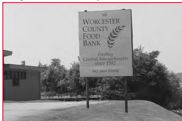
1982 to 2007: 25 years of feeding hungry people in Worcester County with your help

The Worcester County Food Bank's mission is to "engage, educate and lead Worcester County in creating a hunger-free community."